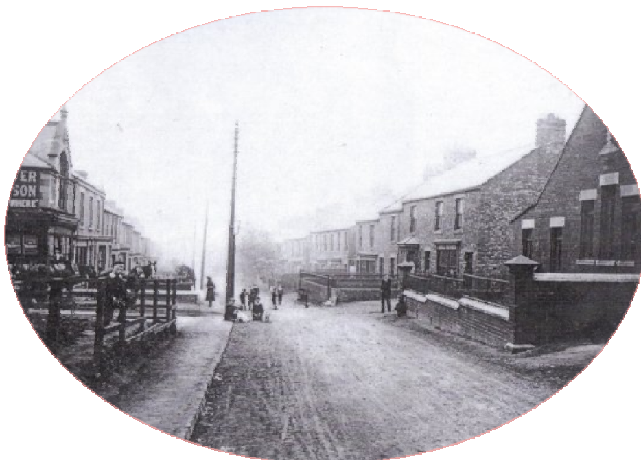
Station Road, Washington Station, c 1900